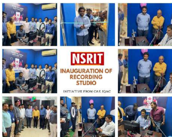
Inauguration of Recording Studio