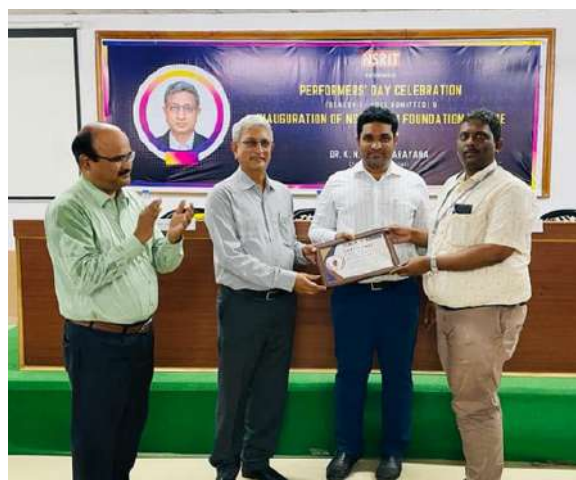
Falication of TPO for best performance