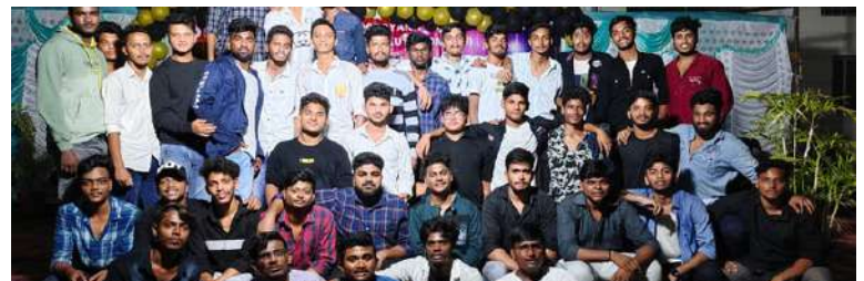
Placement Day Celebrations